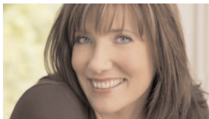
Professor Tanya Byron